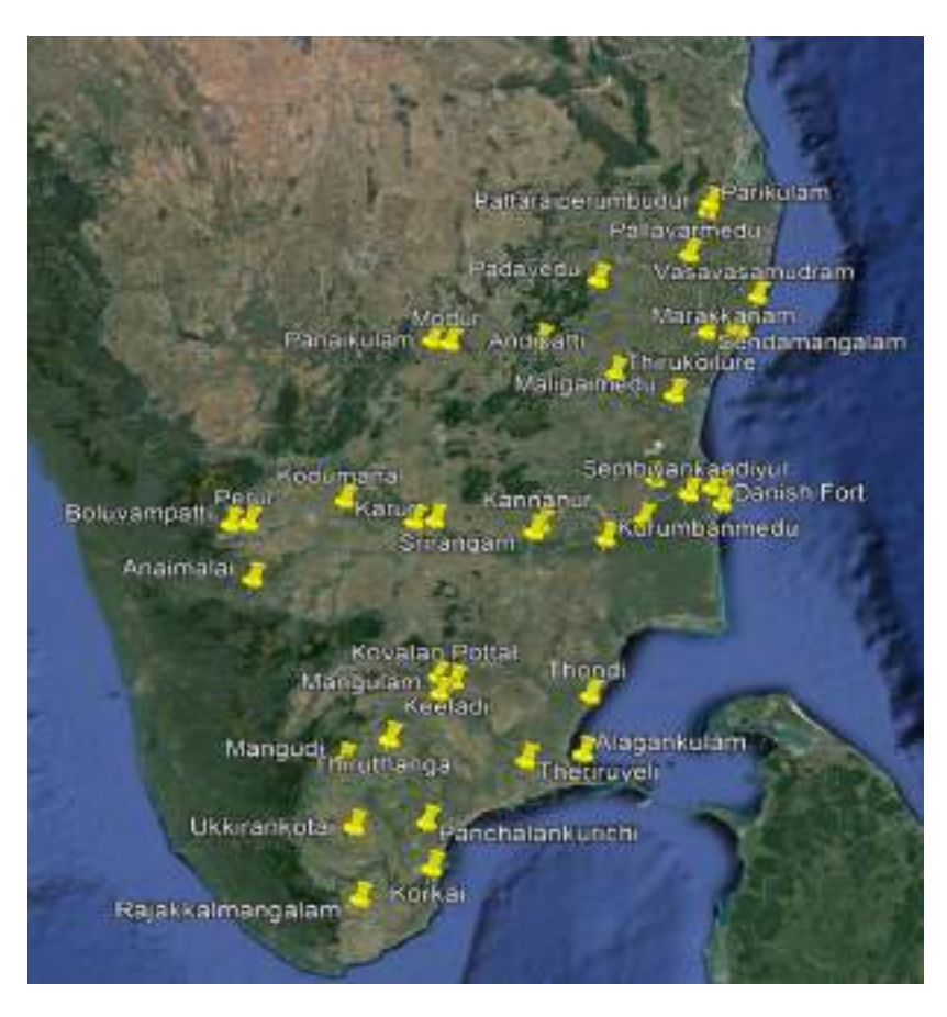
Places of Excavations carried out by Department of Archaeology