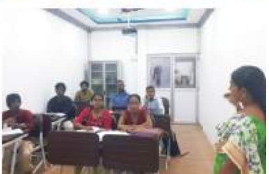
Establishment of Smart Classroom for Institute of Epigraphy