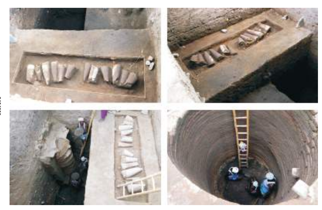
Findings of brick-well (Sangam Age), ringwell and unique conical utensils from the excavation at Pattaraiperumbudur, Tiruvallur District