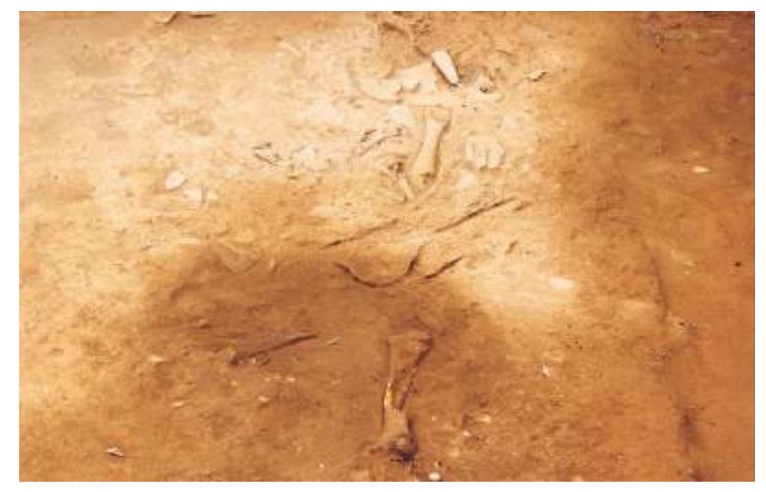
{\bf Exposed\, scattered\, animal\, bones\, in\, the\, excavation\, trench\, -\, Keeladi,\, Sivagangai\, District}